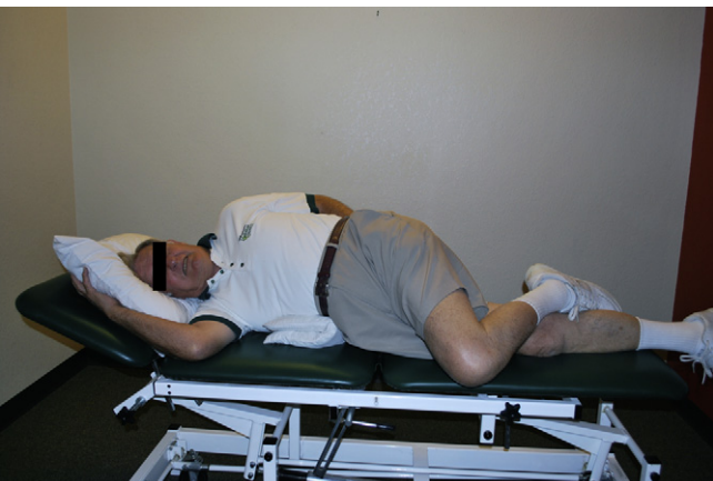
Appendix. C3: Lumbar rotation stretch