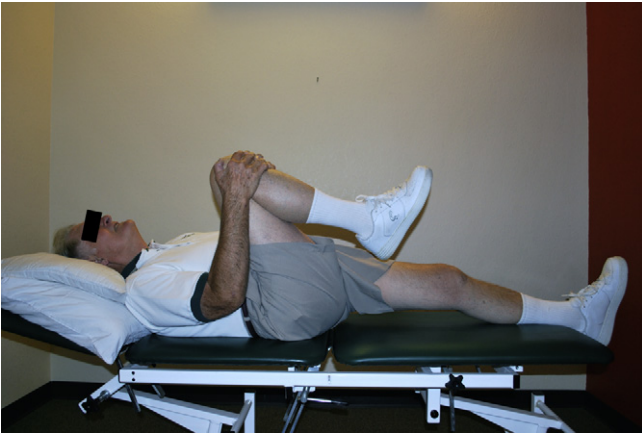
Appendix. C1: Single knee to chest exercise