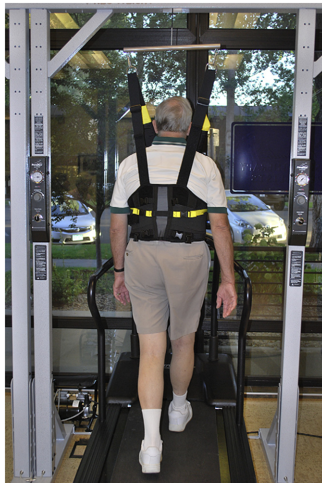
Fig. 2. Unweighted treadmill walking.

Improved flexibility is frequently a key to intervention, as the presentation of the patient with LSS is often one of overall stiffness. Individually identified flexibility impairments can be addressed through manual therapy and self-stretching taught as a home exercise program. Lumbar flexion exercises have long been a foundation of treatment for those with degenerative spinal conditions and are thought to improve spinal flexibility, increase the foraminal cross-sectional area and improve hemodynamics. Several case studies and one RCT have used flexion exercises