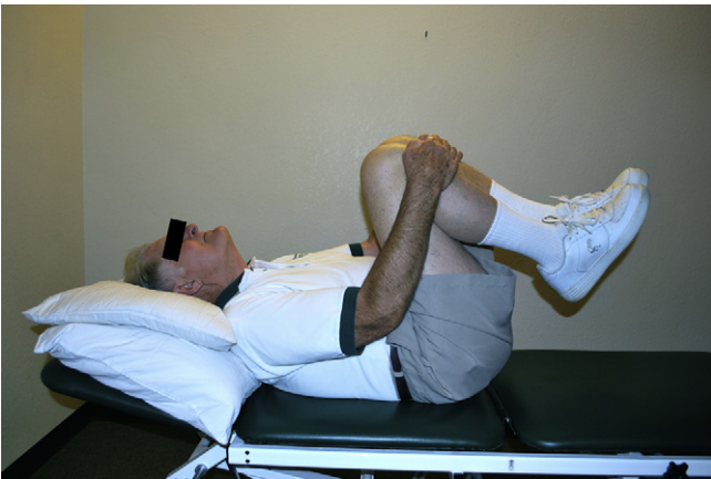
Appendix. C2: Double knee to chest exercise